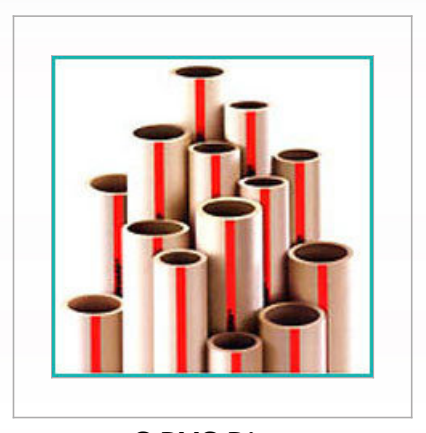
C PVC Pipe