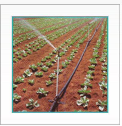
HDPE Sprinkler Pipe