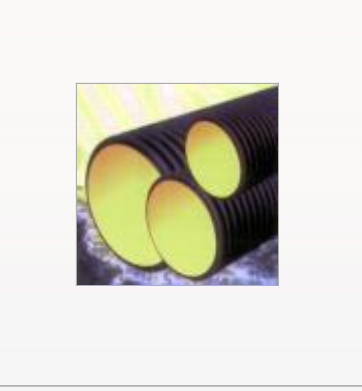
DWC HDPE Corrugated Pipe.