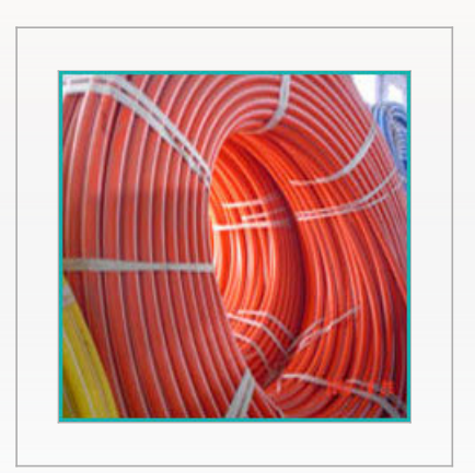
HDPE PLB Pipe