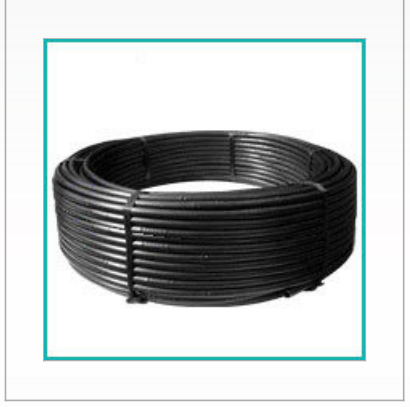
LDPE Drip And Lateral Pipe